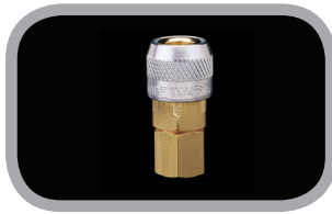
210 Series Automatic