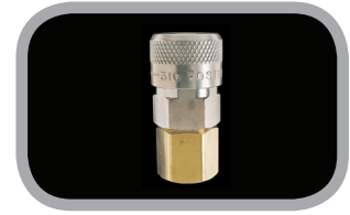
310 Series Automatic