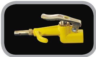
LEVER OPERATED HANDY-AIR™ BLOW GUN