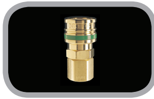
O60 Series Manual