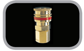
A70 Series Manual