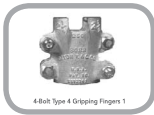
4-Bolt Type 4 Gripping Fingers 1